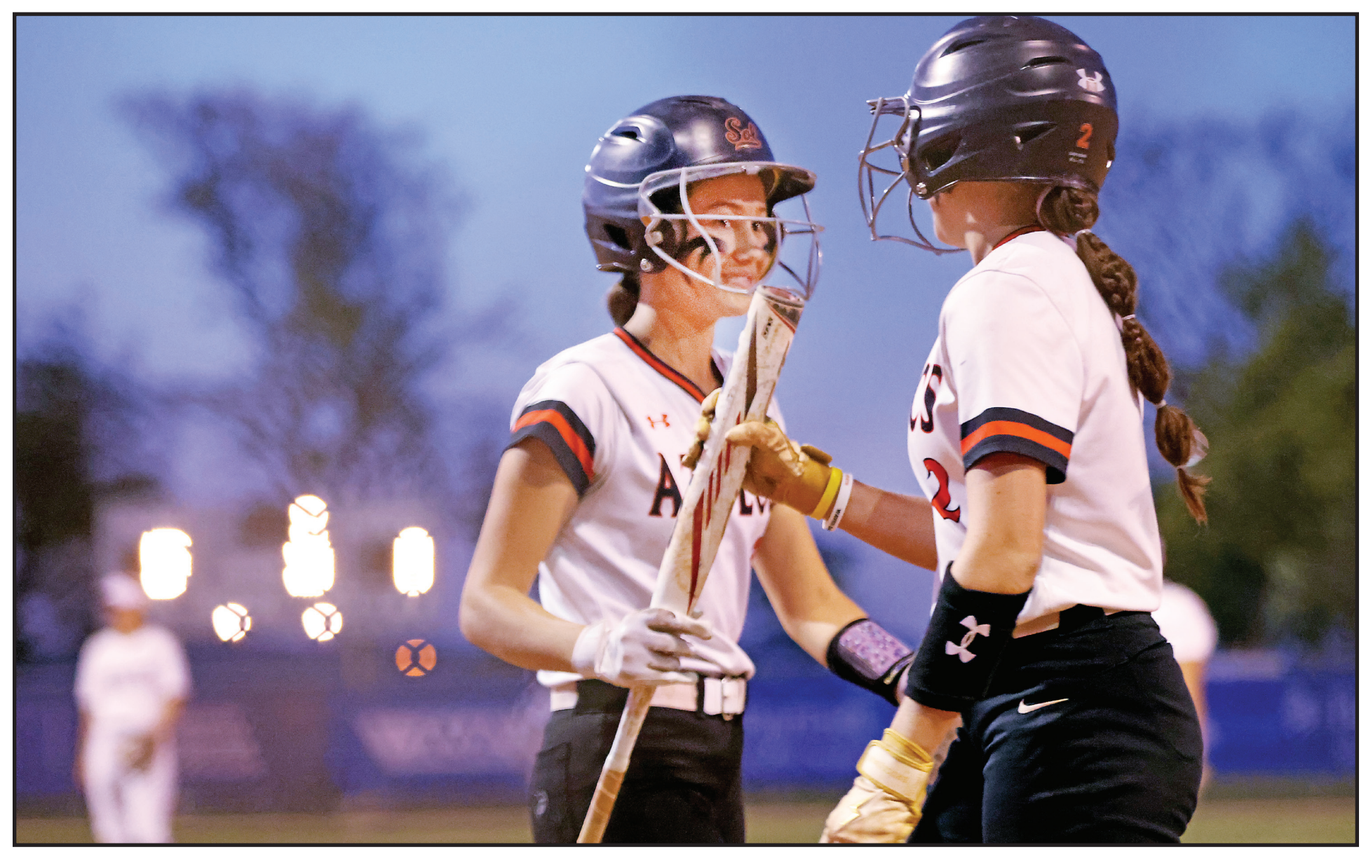
Senior leadership brought Aztecs together on their playoff run.