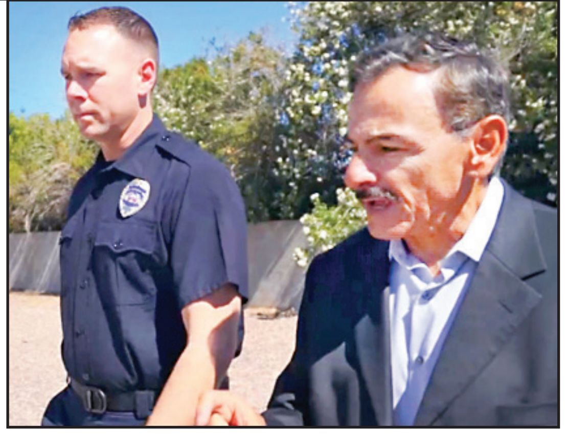
Orlando with Chandler police officer on the lookout for signs of gang activity.

We've also allocated $147,000 for a program to expand the presence of Chandler police in elementary schools. The School Education Engagement program is designed specifically for 6th grade students to provide tools and knowledge to navigate challenges of social media, drugs and peer pressure. Hopefully, early intervention can help these future teens safeguard their potential