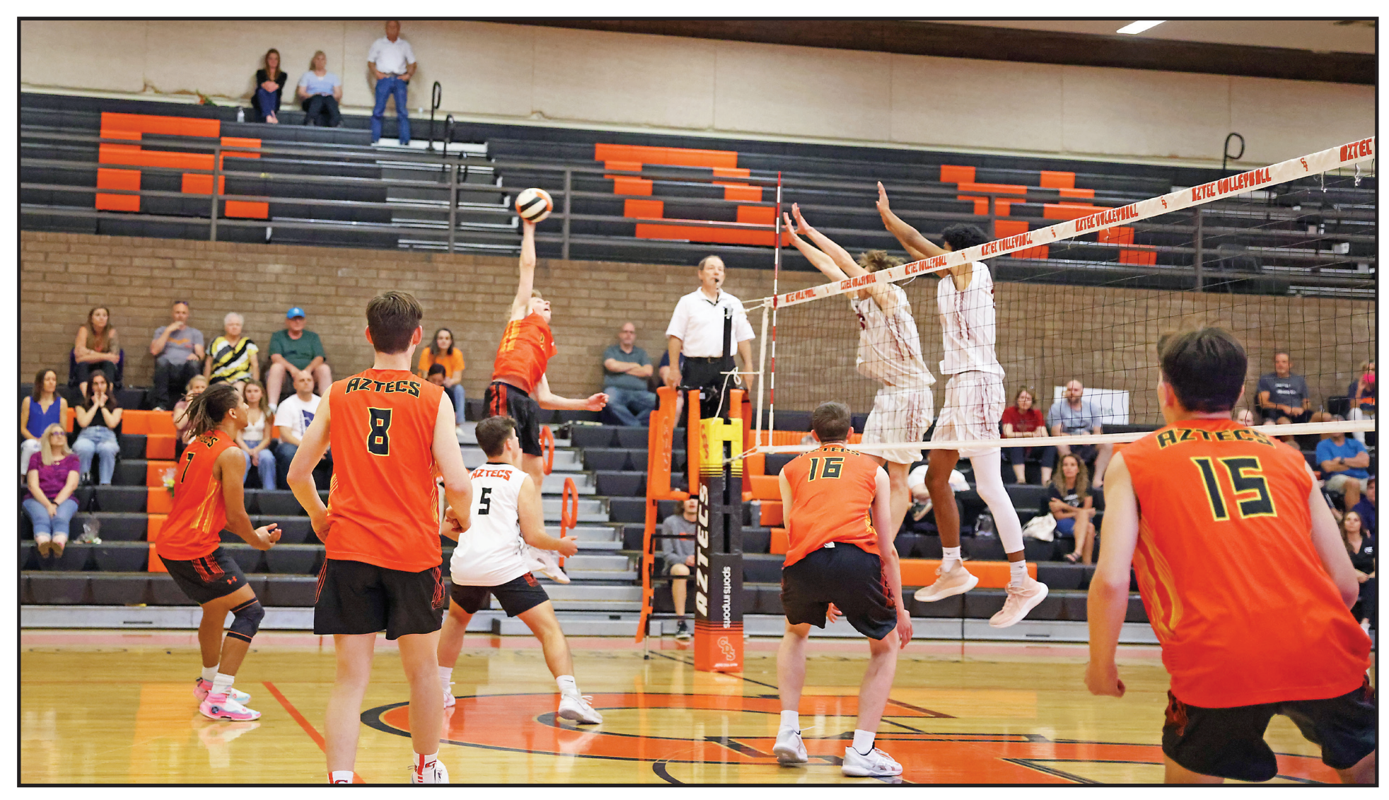
Corona grinds out tough win on Senior Night.